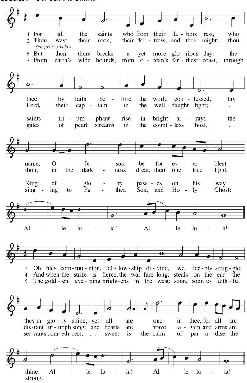
Re-printed under onelicense.net A-734698